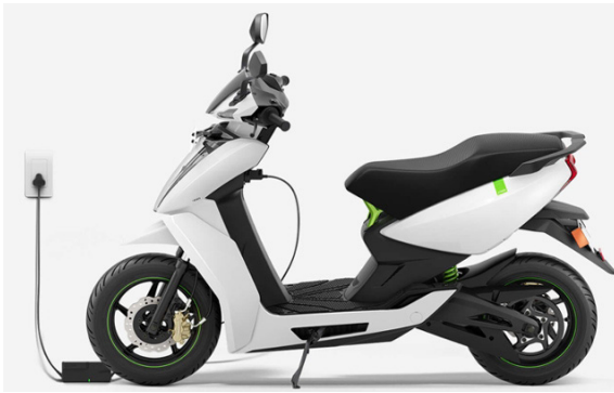
The Ather 450 intelligent electric scooter.

“We had lots of promising ideas, but as a small startup, we did not have the time, money, or people to build prototypes to test each one. With Model-Based Design, we identified and validated the best ideas through simulation, making it possible to deliver a more full-featured scooter in less time.”