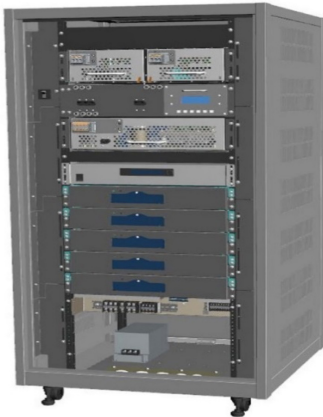
Murata flexible three-phase energy management system with lithium-ion battery.

“Because our programming experience was limited, I expect there would have been many more bugs if we had hand-coded our controller. Generating 100% of our code guaranteed reliability. We read the output and found zero bugs in the code we generated with Embedded Coder.”