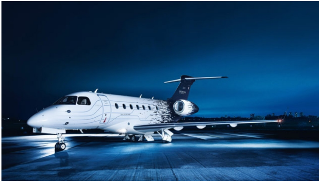
The Embraer Legacy 500.

The Embraer Legacy 500 is the first mid-sized business jet with intelligent flight controls and full fly-by-wire technology. This technology, which replaces mechanical controls in the flight control system (FCS), enables more control surfaces to be actuated simultaneously, leading to smoother flights, reduced pilot workloads, and increased safety. Embraer worked with customers to develop high-level requirements for the Legacy 500. A principal challenge was translating the high-level requirements into well-written low-level requirements for the supplier who would develop the FCS software.