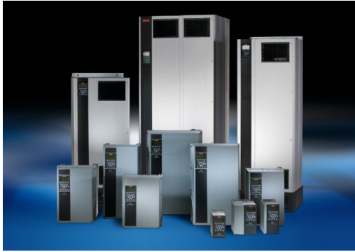
The Danfoss VLT® AutomationDrive FC302.

“We completed our first solar inverter project with Model-Based Design on schedule, despite ramping up new engineers and adopting a new design process. For our second project, we actually reduced development time by 10–15%.”