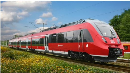
Bombardier train for Germany.

New designs for light rail, metro, commuter, intercity, locomotives, and high-speed trains must meet the specific needs of the cities or regions the vehicles will serve. In addition, software systems for these vehicles must comply with local and country-specific regulations, as well as with industry standards such as EN 50128 and EN 50657.